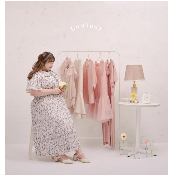
New brand in this fiscal year