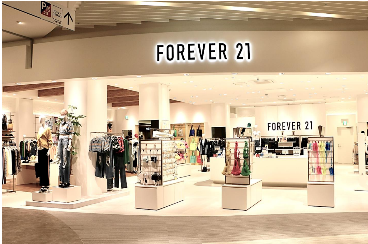
LaLaport Kadoma store