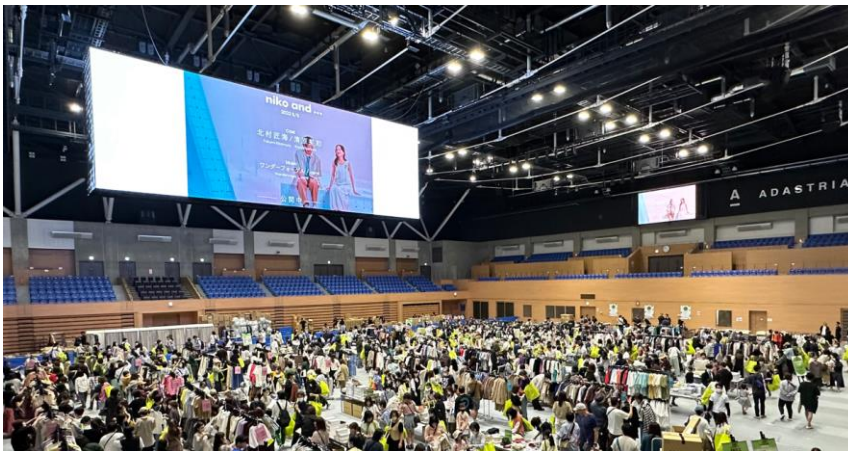
The Family Garage Sale