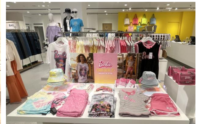
LaLaport TOKYO-BAY store