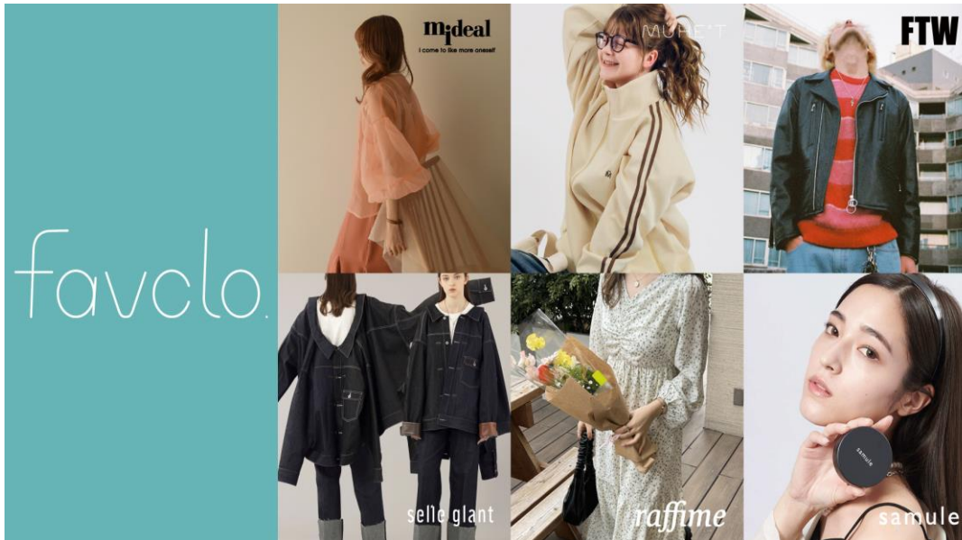
The BUZZWIT “favclo.” EC website