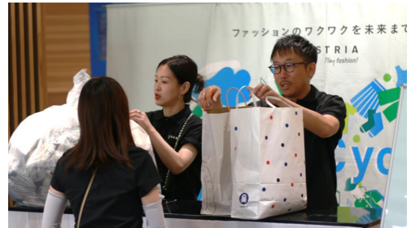
Collection of used clothes (received about 3,500 articles of clothing during two days 355 teams)

URL: https://www.adastria.co.jp/bazaar2023/